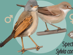
Spectacled Warbler Sylvia conspicillata orbitalis