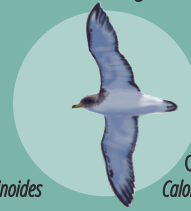
Cory's Shearwater Calonectris borealis