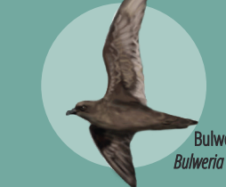
Bulwer's Petrel Bulweria bulwerii