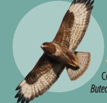
Common Buzzard Buteo buteo insularum

A ravine flanked with excellent steep inclines for rock dwellers and pools for freshwater birds. Palm tree groves suitable for nocturnal birds of prey.