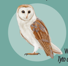
Western Barn Owl Tyto alba

Farmstead and smallholdings integrated in a Canarian Palm Tree grove, with presence of typical birds for anthropised environments, agricultural birds and diurnal and nocturnal birds of prey.