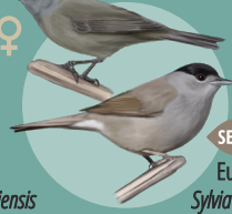
Eurasian Blackcap Sylvia atricapilla heineken