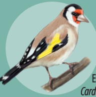
European Goldfinch Carduelis carduelis parva