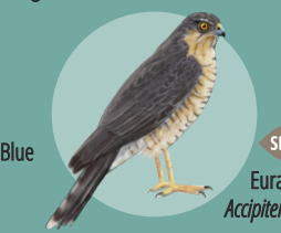
Eurasian Sparrowhawk Accipiter nisus granti