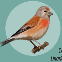
Common Linnet Linaria cannabina meadowaldoi