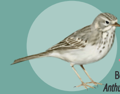
Berthelot's Pipit Anthus berthelotii

Soft water Tabaiba scrub area in perfect state of conservation, with points permanently under water, providing suitable environment for small insect and grain eaters.