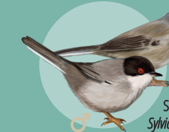
Spectacled Warbler Sylvia melanocephala leucogastra

Thermophilous Atlas Pistachio woods protected by the highest peaks of Guguy. Attractive opportunities to observe fruit eating passerines and diurnal and nocturnal birds of prey.