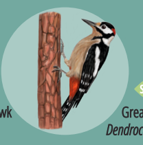
Great Spotted Woodpecker Dendrocopos major thanneri