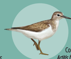
Common Sandpiper Actitis hypoleucos