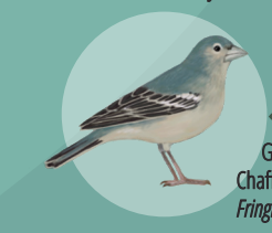
Gran Canaria Blue Chaffinch Fringilla polatzeki

A dry Canarian pine grove in good state of conservation. A vital area of woods for woodland birds and the only habitat of natural origin for the Gran Canaria Blue Chaffinch.