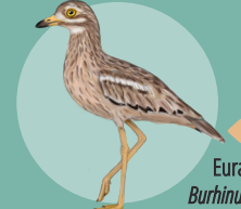
Eurasian Stone Curlew Burhinus oediceramus distinctus

An extensive sedimentary plain boxed in between semi-desert mountain slopes. The habitat of steppe birds and species associated with the Canarian bush "balera" and various plants of bush habit.