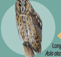
Long-eared Owl Asio otus canariensis