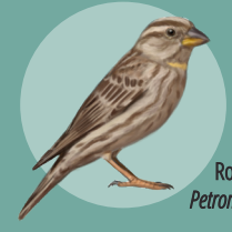
Rock Sparrow Petronia petronia