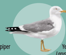
Yellow-legged Gull Larus michahellis