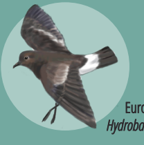
European Storm Petrel Hydrobates pelagicus