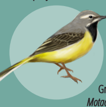
Grey Wagtail Motacilla cinerea canariensis