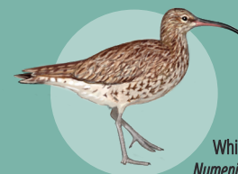
Whimbrel Numenius phaeopus

Intertidal spaces which are ideal for waders and coastal water birds.