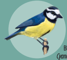
Blue Tit Cyanistes teneriffae hedwigae

A small oasis with abundant fruit trees, ideal for insect and fruit eating passerines.