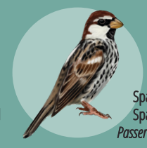
Spanish Sparrow Passer hispaniolensis