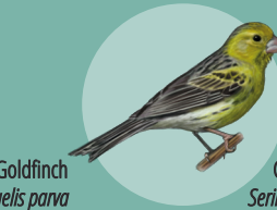
Canary Serinus canarius