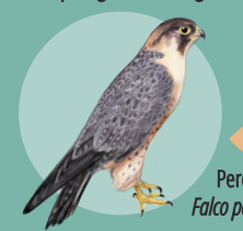
Peregrine Falcon Falco peregrinus peregrinoides

Sea cliffs representing one of the most spectacular geological formations in the archipelago. Breeding area for sea birds and rock-dwelling birds of prey.