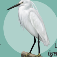
Little Egret Egretta garzetta