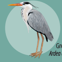
Grey Heron Ardea cinerea