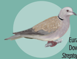
Eurasian Collared Dove Streptopelia decaocto

A plantation of maritime pines and tamarisks. A feeding point for resident grain eaters with temporary presence of migratory passerines.