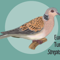
European Turtle Dove Streptopelia turtur