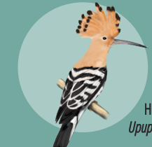
Hoopoe Upupa epops

A sheltered quiet valley with varied agricultural activity, plains and semi-desert mountainsides and crags. Agricultural and steppe birds and rock dwelling birds of prey.