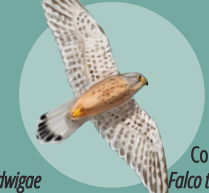
Common Kestrel Falco tinnunculus canariensis