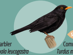
Common Blackbird Turdus merula cabreriae