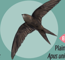
Plain Swift Apus unicolor