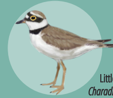
Little Ringed Plover Charadrius dubius

A pebble beach, a coastal marsh and a tamarisk marsh of maximum interest for waders, aquatic birds and small woodland birds, both residents and migrants.