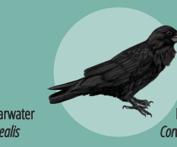
Northern Raven Corvus corax canariensis