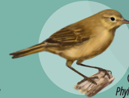
Canary Islands Chiffchaff Phylloscopus canariensis