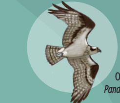
Osprey Pandion haliaetus

A mountainous massif with abrupt ravines and sea cliffs. Of particular importance for sea birds and rock-dwelling birds of prey.